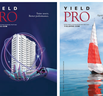
SEPTEMBER OCTOBER 2022 NOVEMBER DECEMBER 2022